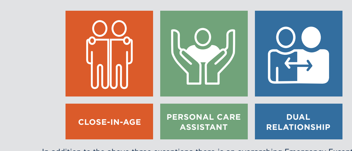
In addition to the above three exceptions there is an overarching Emergency Exception that applies in all areas of the MAAPP.