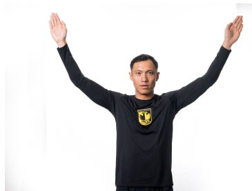
Play has stopped