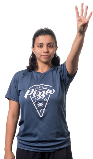
Announce stall (use appropriate number of fingers)