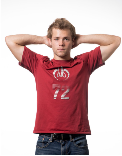
Gender ratio: 4 men-matching players