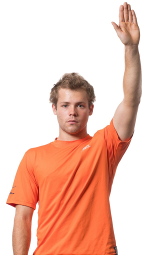
Call on field