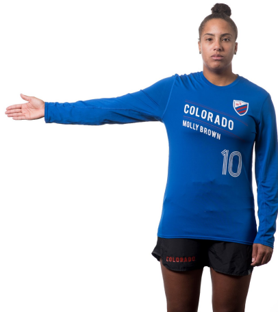
In- or out-of-bounds