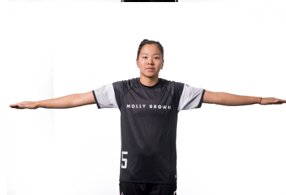
Retraction (3 swipes)