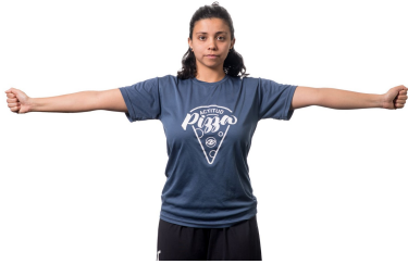
Gender ratio: 4 women-matching players