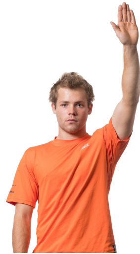
Call on field