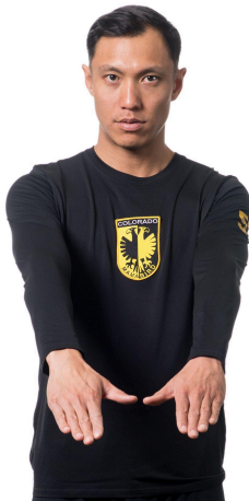
In the end zone