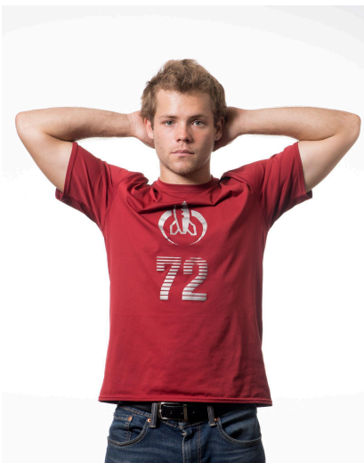
Gender ratio: 4 men-matching players