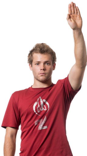
Readiness or brick