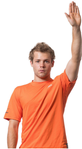
Call on field