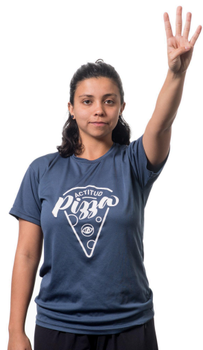
Announce stall (use appropriate number of fingers)