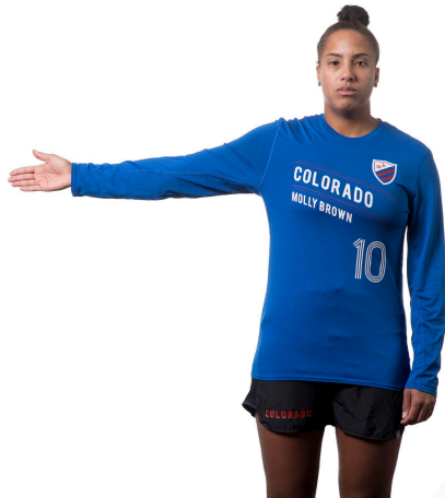
In- or out-of-bounds