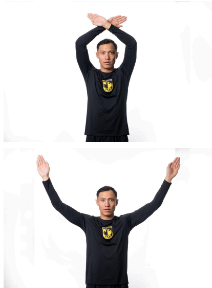
Play has stopped