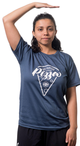
Stall or time violation