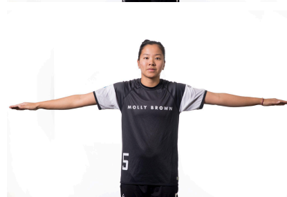
Retraction (3 swipes)