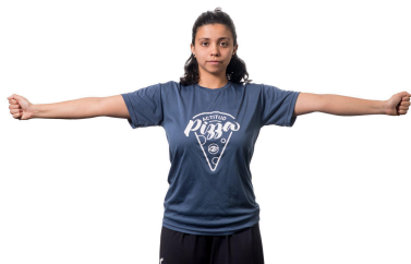
Gender ratio: 4 women-matching players